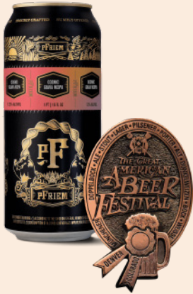
pFriem Cosmic Guava WCIPA 2025 GABF® Bronze Medal West Coast IPA category