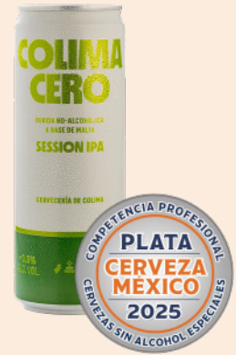
Colima Cero Session IPA Cerveza México 2025 Plata (Silver) Special Non-Alcoholic Beers category

“We have thoroughly enjoyed working with the Euphorics product line. This product has helped increase overall aromatic and flavor intensity while integrating seamlessly into beer at relatively low usage rates, all while not adding significant haze to the final product.”