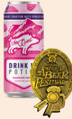
Von Ebert Drink Me Potion 2025 GABF® Gold Medal American Fruit Beer category