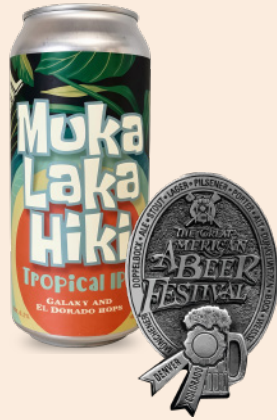
Hop Dogma Muka Laka Hiki 2025 GABF® Silver Medal New Zealand IPA category