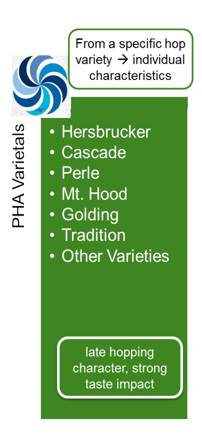
Figure 1: PHA® Varietal

PHA® Varietals are prepared from cone hops by specific extraction and distillation methods. They consist of original hop oil compounds in an aqueous propylene glycol (PG) solution. PG is a permitted carrier for flavours as per regulation 2006/52/EC. PHA® products are exclusively supplied worldwide by BarthHaas.