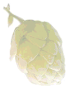
East Kent Golding:

A traditional variety with good aroma and considered as a successor of Hallertauer Mittelfrueh